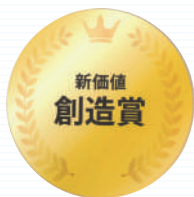
2017 New Value Creation Award