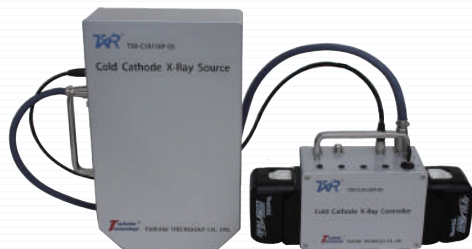
Compact X-ray Inspection System