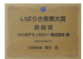
2015 Ibaraki Industry Grand Award