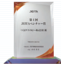
The 1st JEITA Venture Award